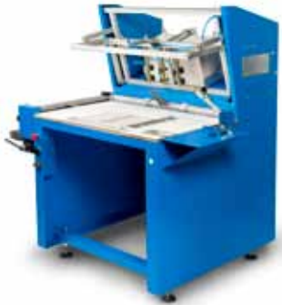
Roby Junior 2

Casemaker with automatic board feeder Max size: cm 50 x 70 Max speed: cycles/hour 250